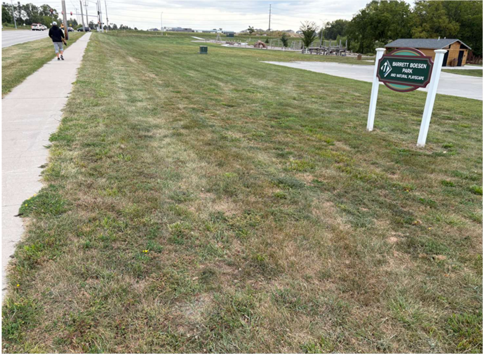
Unique play amenities at the park

Open turf area at the entrance of the park, where the commissioned artwork would be located.